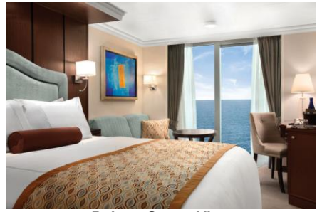
Deluxe Ocean View Approx. 242 ft<sup>2</sup> from $3,798

Oceania Cruises' beautiful 1,250 passenger Riviera will be your home. As we indulge in European culture, we will experience wine tastings, wine parties, and exclusive wine dinners. Learn about this renowned Washington State winery, as we share great wines, stories, and experience the grandeur of Europe.